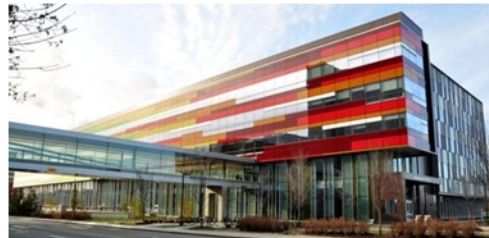
The Edmonton Clinic Health Academy

Happy New Year to all and best wishes for 2012! I believe the fall of 2011 was surely the busiest in the history of TREC. During the week of December 12-16 the Faculty of Nursing moved to a new state of the art building on campus, the Edmonton Clinic Health Academy (ECHA) - picture on the right. The kids across the street in the Stollery Children's Hospital have named it the "Lego building". We are located on the 5 th level facing NE, the corner you see in the picture.